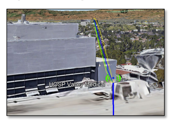
Example: Line of sight radio path between Valley Medical and San Jose hub